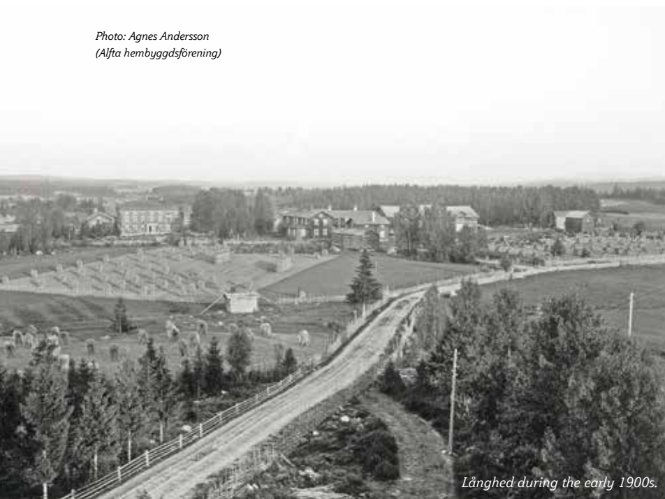
Långhed during the early 1900s.