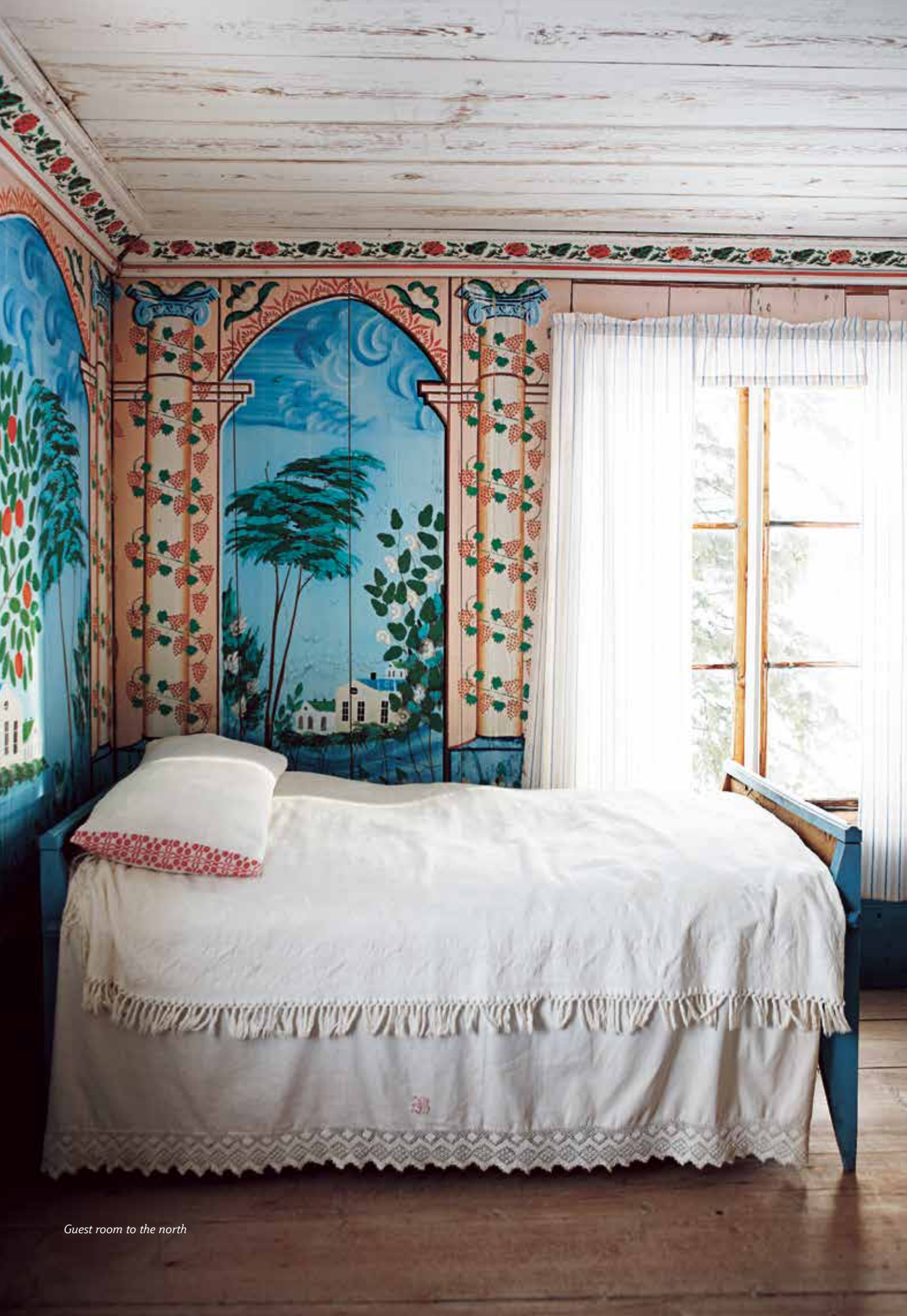
Guest room to the north