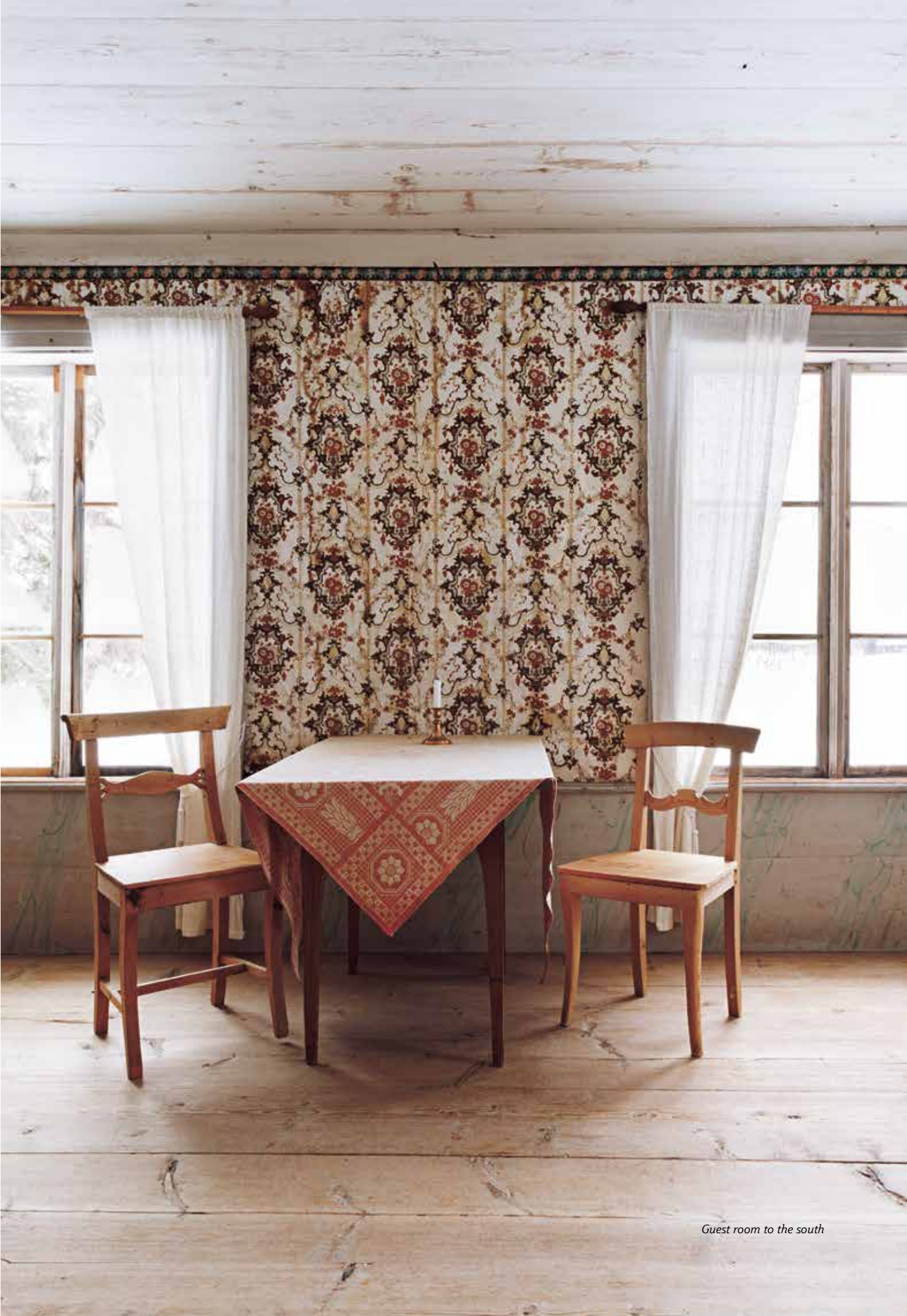
Guest room to the south