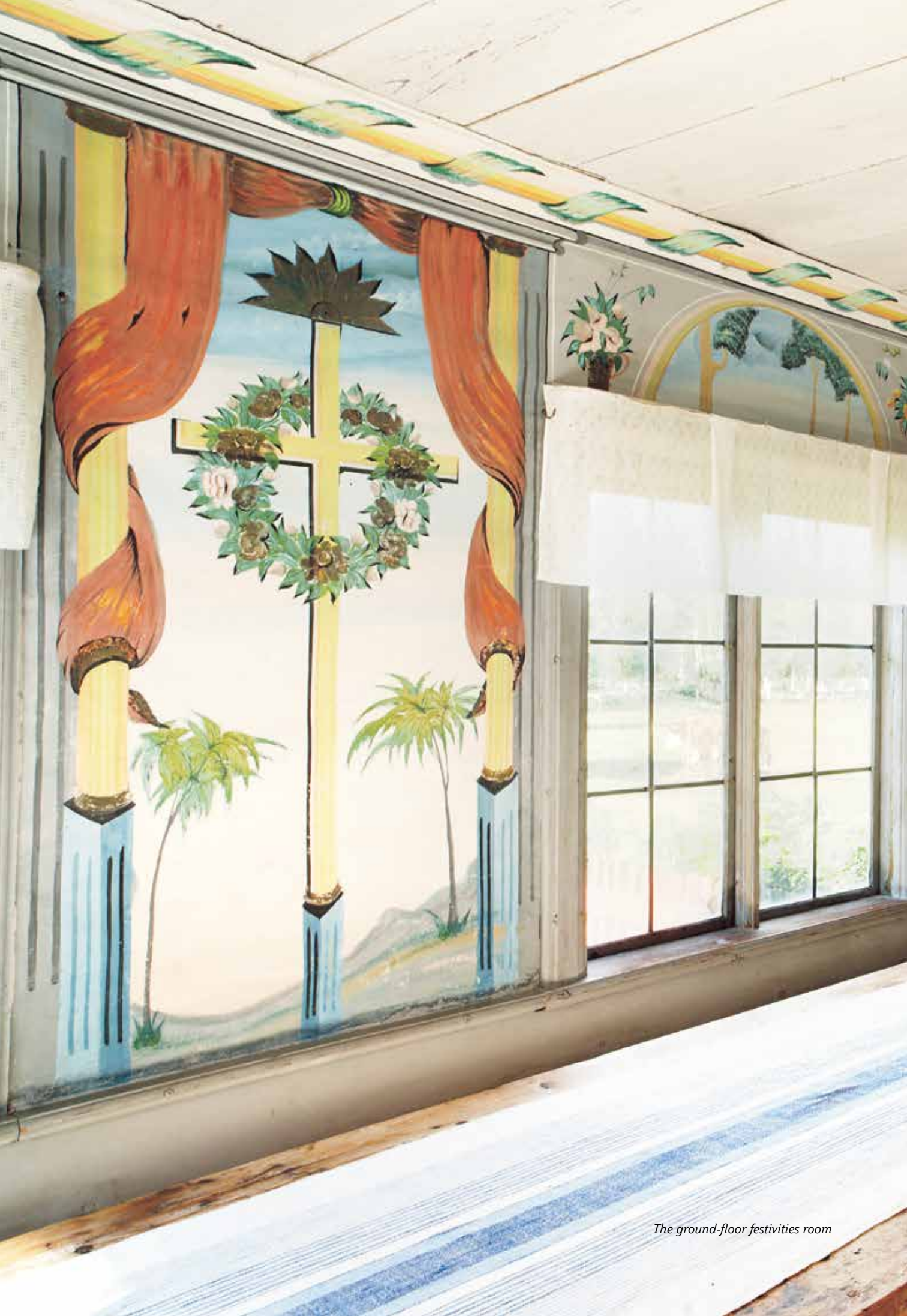
The ground-floor festivities room