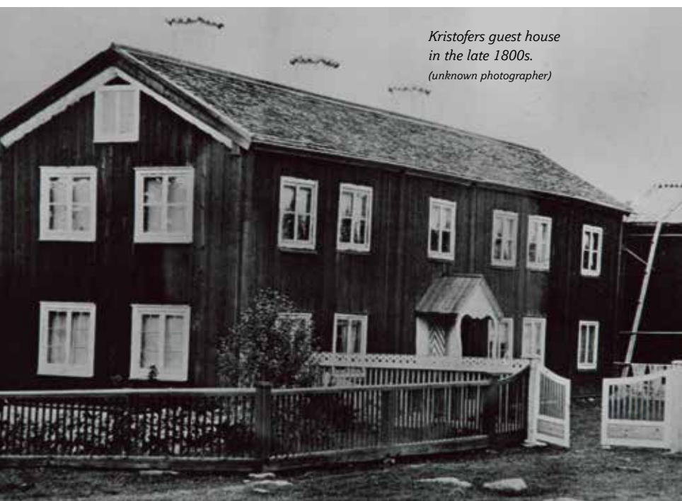
Kristofers guest house in the late 1800s.

» A World Heritage site is an environment considered globally unique and therefore important to all of humanity. The criteria that must be met to warrant designation as a World Heritage Site are governed by a 1972 convention adopted by the UN agency UNESCO.